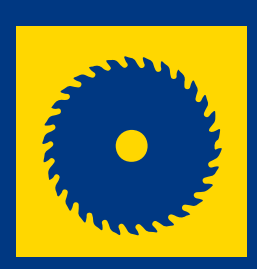
22 Ministry Locations